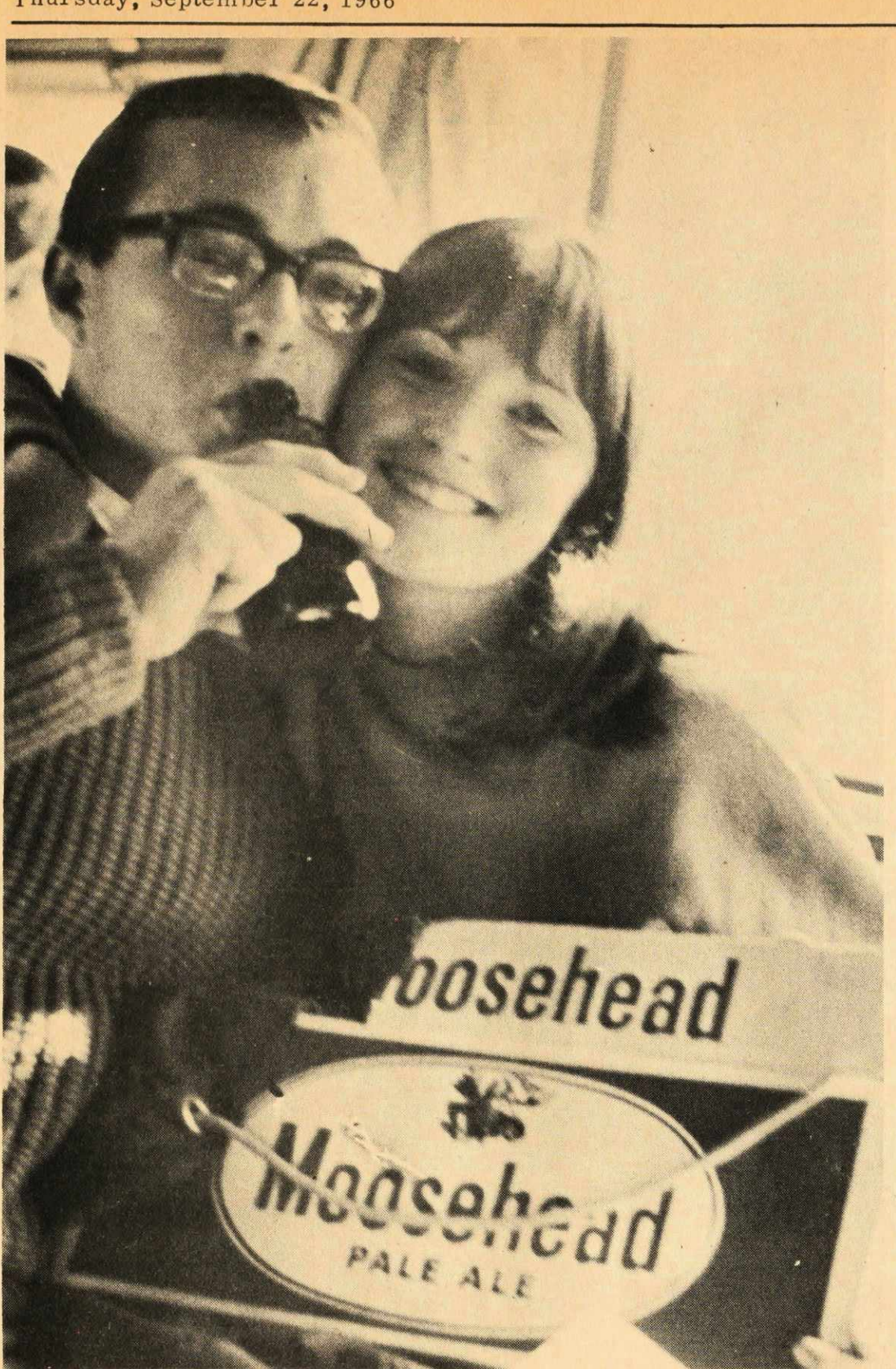
Rolling home from Truro

A PAIR OF tired Tiger supporters chug their way back from Truro after seeing the black and gold take it on the chin. The trip down from Halifax was noisy but orderly. There were no complaints either from the railway or the townspeople of Truro. In fact, the trip was such a success that council is trying to drum up support for another.