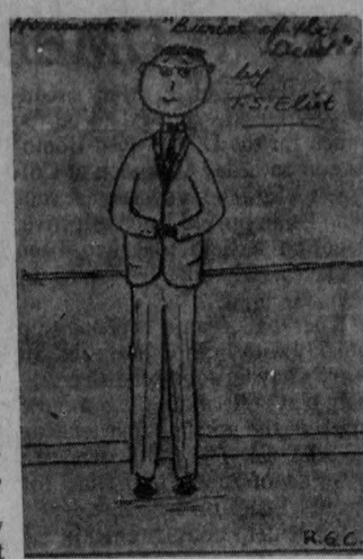
And now we shall talk about the Cuban situation.

open each day at 8:00 a.m. open Tuesday and Friday evenings Just a few steps from the campus Up Albert St. at the corner of Regent St.