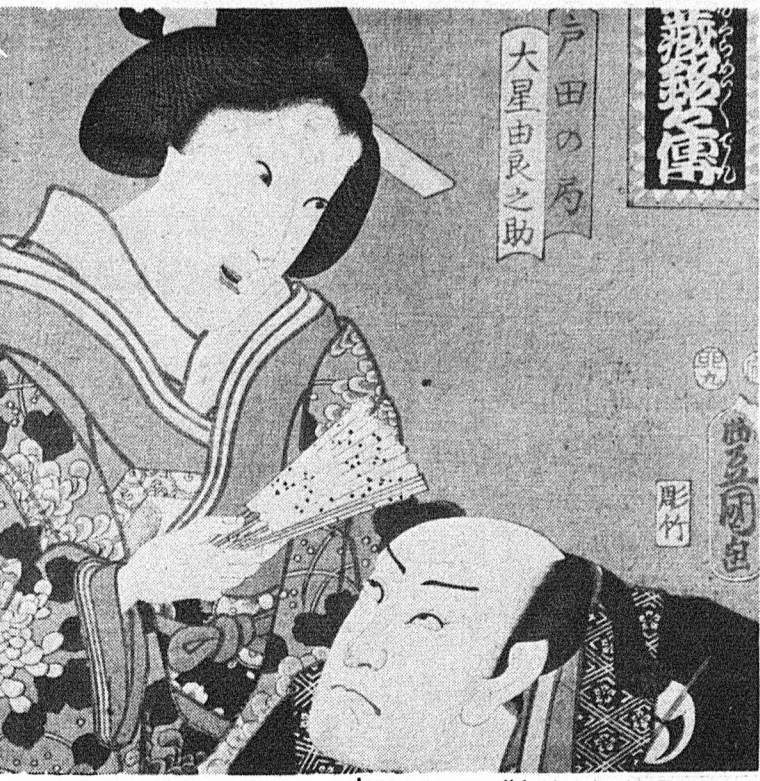
Japanese woodblock print by Toyokuni.

pieces in all price ranges. The gallery's representative at the sale will answer any questions about the artists, techniques, and collecting. The presentation is informal and you are encouraged to examine all of the works.