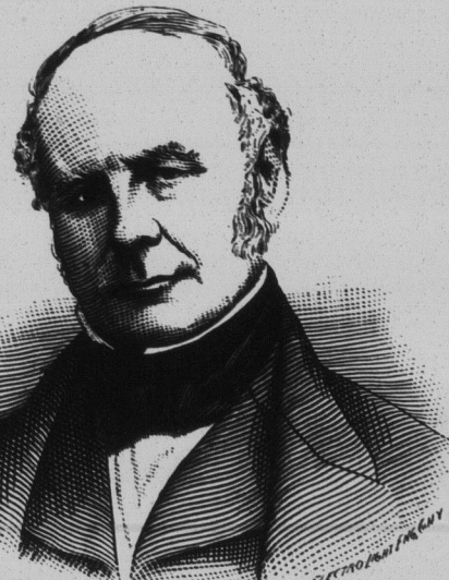
JUDGE HALIBURTON (SAM SLICK).

Haliburton as an Author. Haliburton having thus planted his foot