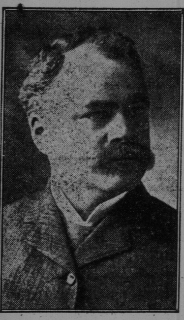
J. D. HAZEN, M. P. P., Chairman

Mr. Borden said there was not one of the citizens who might feel to prevent him from thanking them for the kind things they had said, and the many kindnesses shown him.