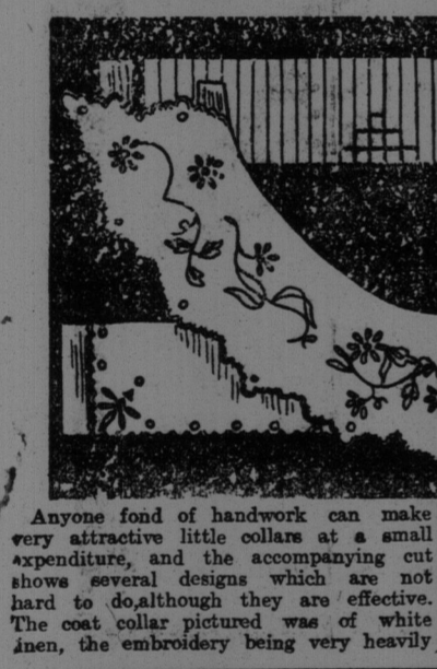
Anyone fond of handwork can make very attractive little collars at a small expenditure, and the accompanying cut shows several designs which are not hard to do although they are effective.