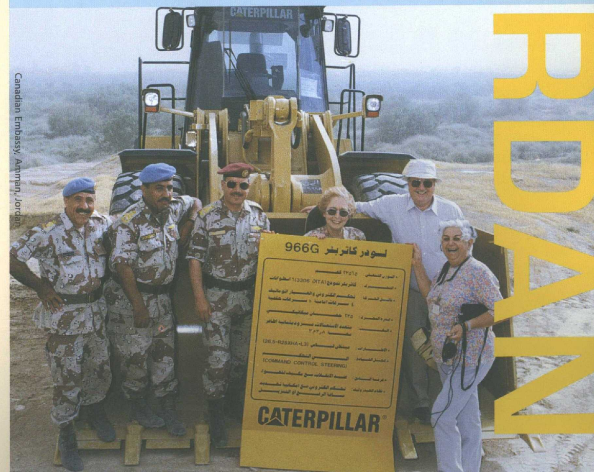
Canadian Embassy, Amman, Jordan

It was a rare opportunity to learn the extent of the landmine problem in Jordan and to witness first hand the work conditions of the deminers in the Royal Corps of Engineers. The weather vividly illustrated the level of difficulty in demining the Jordan Valley. Hot, dusty, extreme winds – the Khamaseen low pressure front – were hampering the