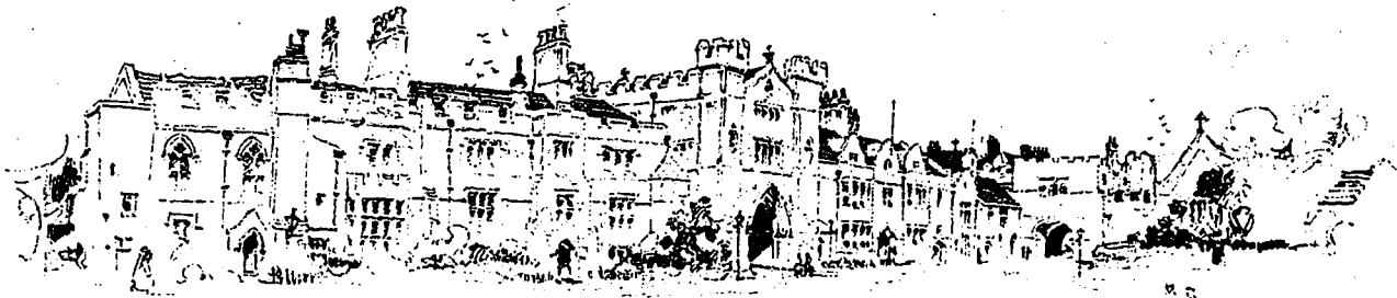
IN FRONT OF PETERBOROUGH CATHEDRAL.