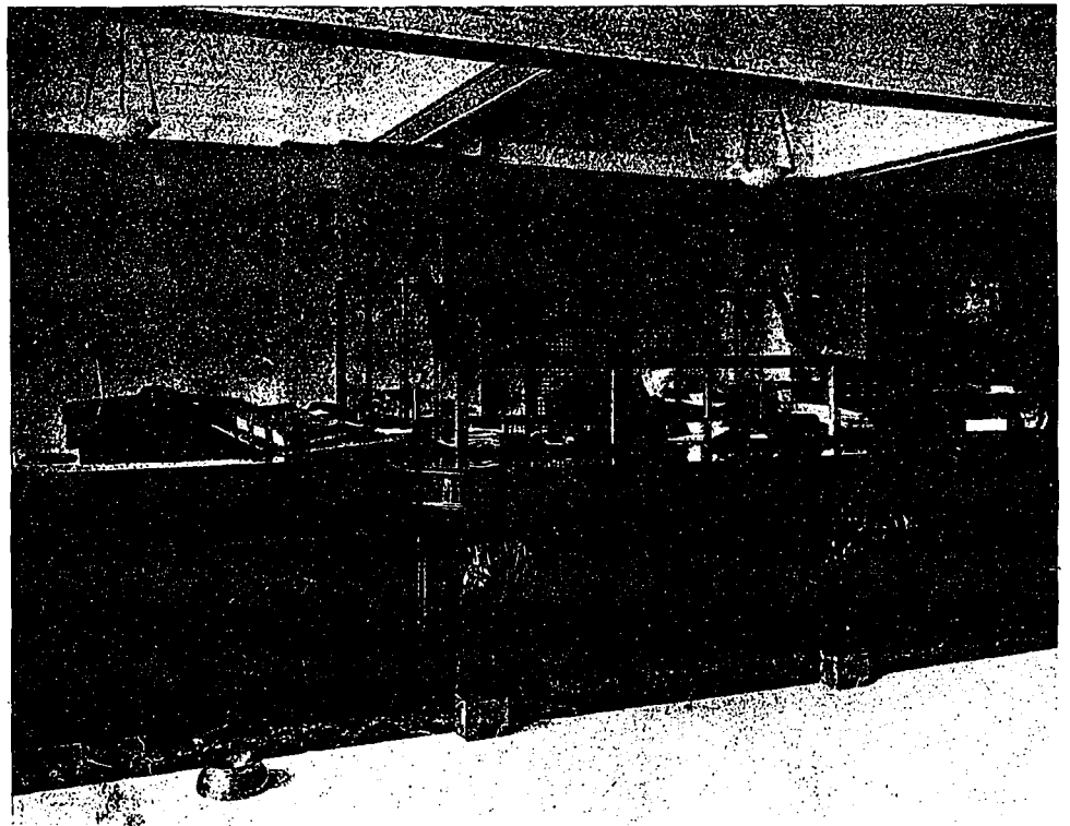
DETAIL OF COUNTER, MAIN BANKING ROOM, TRUST AND GUARANTEE BUILDING, TORONTO.

After all, taken from the physical point of view, the difference between these different chords is simply due to the degree of complexity