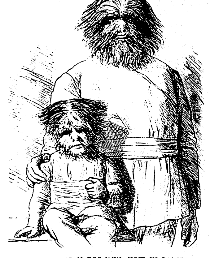
THE RUSSIAN DOG-MEN, NOW IN PARIS.

August's ENTLEMEN wishing for the best Ornamental or Fruit Tress. Flowering Shrubs, Peronnial or Annual plants, &c., would do well to send their orders to SHANLKY & GALLAGHER, Wholesale and Retail dealers in Fruit and Ornamental Trees, Shrubs, Hoses, Bulbs, Seeds, &c.. P. O. Box 217, Rochester, N. Y.