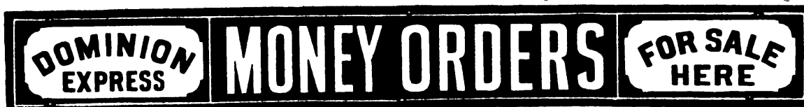
No. 3. Size 24 x 3 inches. White letters on blue ground.