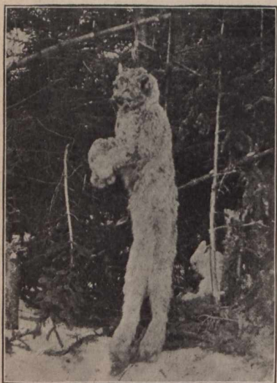
Lynx au piège