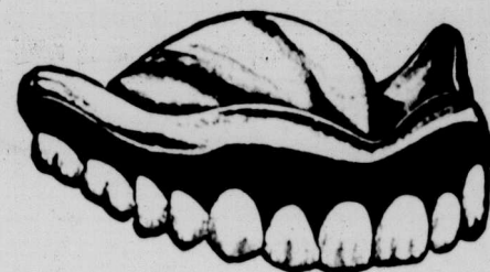
Plate, $8.00 to $25.00 per Set