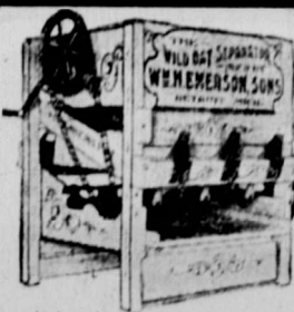
Made in Three Sizes: 6 SHOE POWER SEPARATOR 3 SHOE HAND SEPARATOR 1 SHOE ELEVATOR WHEAT TESTER