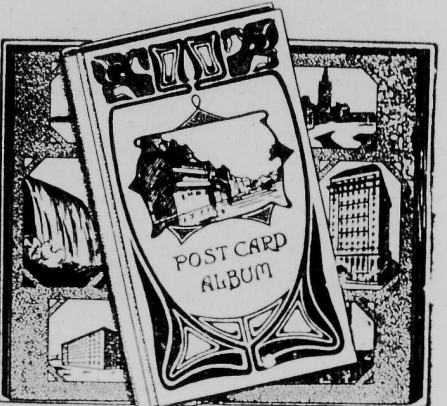
Given for selling Colored Picture Post-cards, 6 for 10c.

This Big Postcard Album is handsomely bound; the front cover elegantly decorated in colrs. It holds 400 picture cards. With it we give 100 colored postcards, no two alike, for selling only $3.00 worth of lovely picture postcards, Valentine, Easter, fancy, birthday, flower riews, etc., highest quality, beautifully colored. At 6 for 10c they go like hot cakes. Just say you will do your best to sell. Write your name and address plainly. The Gold Medal Premium Co., Why, mother, I'm twelve years old, Card Dept., 37F, Toronto.