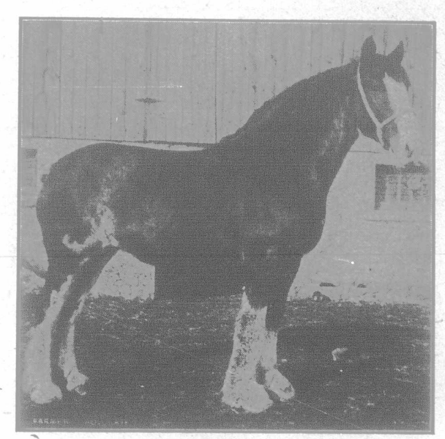
Manilla. Four times winner of the brood mare class at Ottawa for B. Rothwell.

The efficiency of the hog is determined by his ability to make a maximum gain on the minimum amount of feed. To do this the young pig must be kept thrifty and suffer no set-back through improper feed or feeding.