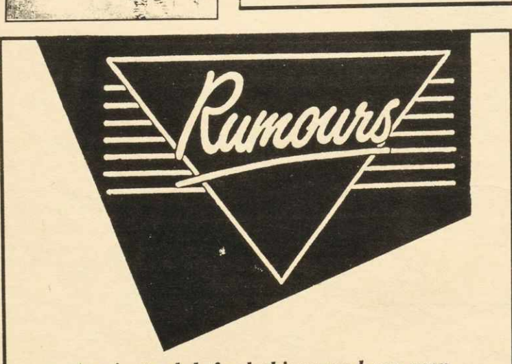
A private club for lesbians and gay men. The only one of its kind in Nova Scotia. Monday to Saturday, from 8pm Cover charge after 9pm for non members. .2112.Gottingen.St..423-6814.

* The mandate of PCIC is to provide consultative service and deep discounts on Microcomputer purchase to university students, staff, and faculty, therefore valid university IDs will be required