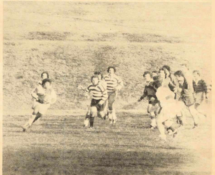
Catch him if you can!

The next rugby game is this Saturday at 2:00 at Studley Field. (Look for posters). Until next week. May your scrum never falter and may your hooker never miss.