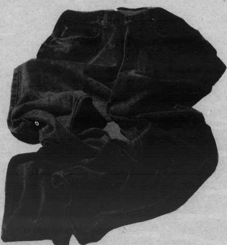
Tradition that stands the test of time