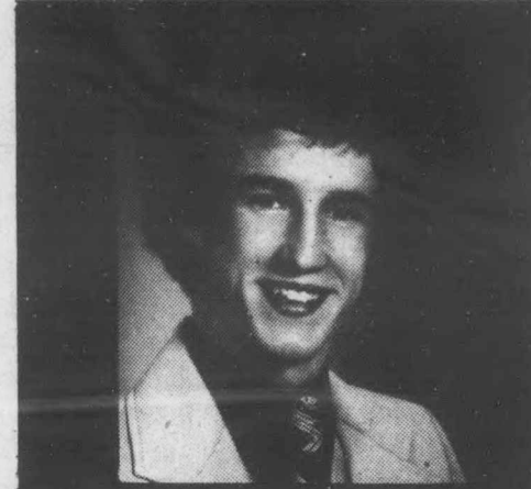
Fletch DISGUISE I "Me"