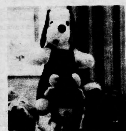
Sharkie, Buffalo, Doggie and Bea-BAI Animals II Nowhere, we just wait out at the experimental farm....