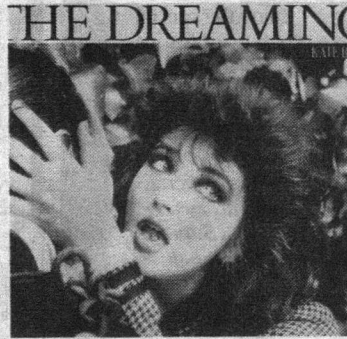
The Dreaming $7.50