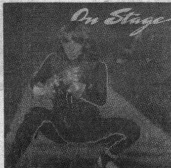
On Stage Mini-LP $3.95