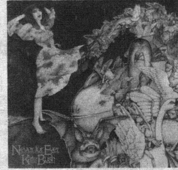
Never For Ever $7.50