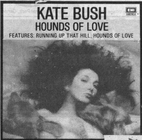
Hounds of Love $7.50