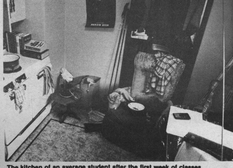
The kitchen of an average student after the first week of classes.

Having difficulties with the red tape? We can help Open Sept. 4-8 11-3 Daily Main Floor Beside the Candy Counter