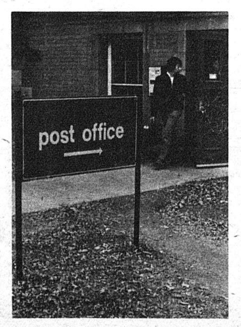
U of A will be hard hit

The automation and mechanization program involves the use of very sophisticated machinery. The first step in the automation and mechanization program involves the use of very sophisticated machinery. The first step in the automated process is the Culler Facer Cancellor which cancels and faces mail all one way in preparation for