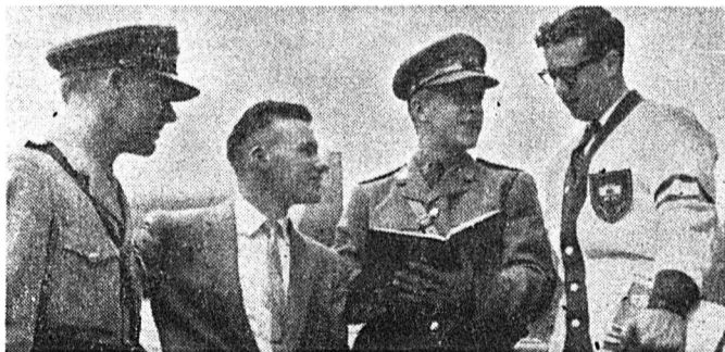
THE CANADIAN OFFICERS' TRAINING CORPS —University undergraduates may obtain a commission by training during their spare time and summer holidays. The student who trains under this plan is paid for his actual training time and is not obligated for full-time service after graduation.