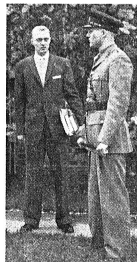
THE OFFICER CANDIDATE PROGRAMME —Selected high school graduates, not wishing to undergo academic training for a degree, may qualify as a short service officer after a brief intensive period of military training and later may apply to become a regular officer.

You may obtain full information on any of these plans from your University Army Resident Staff Officer.