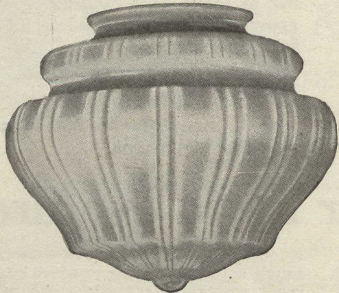
No. 9070. Grecian Lantern.

It is cheaper, too, than the old way, for less candlepower will produce more illumination, so great is the deflecting and diffusing effect of this chemically perfect glass.