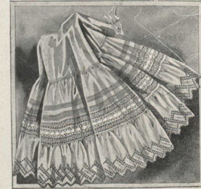
R1-90. Women's Skirt , made of fine cotton, extra deep umbrella flounce of two clusters of fine tucks, two rows embroidery insertion with one row Val. insertion between, finished with wide frill of skirting embroidery, French band, dust ruffle, lengths 38, 40 and 42 inches..... 1.65

Write for our Spring and Summer, and Summer Supply Catalogues.