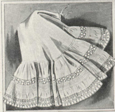
R1-40. Women's Skirt , made of cotton, deep muslin flounce with cluster of tucks, one row lace insertion and frill of muslin edged with lace, French band, lengths 38 and 40 inches..... .59