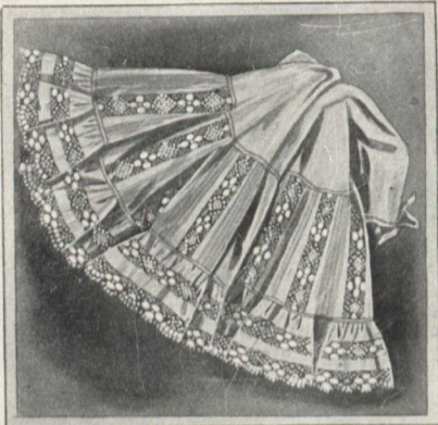
R1-20. Women's Skirt , of fine nainsook, deep flounce with 28 rows of wide lace insertion running up and down, with tucked lawn between, finished with frill of lawn, lace insertion and lace edging, dust ruffle, lengths 38, 40 and 42 inches..... 1.58