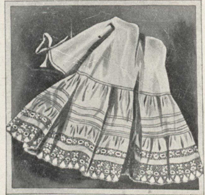
R1-70. Women's Skirt , made of good cotton, French band, deep umbrella flounce of fine lawn trimmed with three 1/4-inch tucks, lawn frill with one row lace insertion, finished with edge of lace, lengths 38 and 40 inches..... .75