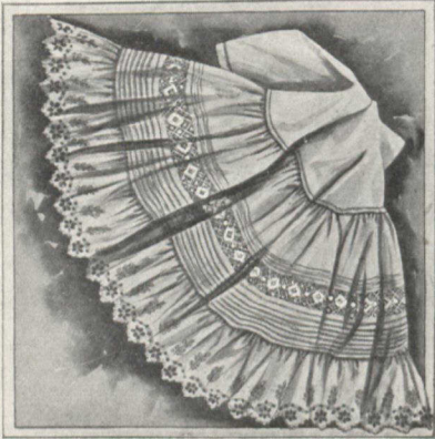
R1-10. Women's Skirt , made of fine cotton, deep umbrella flounce with two clusters of tucks, one row lace insertion, frill of good embroidery, French band, lengths 38, 40 and 42 inches, extra value..... 1.00

Notice 5 spools on machine illustrated which feed 5 needles, making 5 rows of tucking at one operation. We guarantee entire satisfaction in quality, finish and price. If not, goods exchanged or money refunded. This year's dress styles demand white skirts. Don't miss these saving chances.