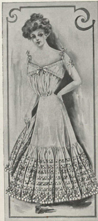
R1-50. Women's Skirt , made of good cotton, French band, deep umbrella flounce of good lawn trimmed with six rows of torchon insertion finished with deep ruffle of lace, dust frill, lengths 38, 40 and 42 inches..... 1.29