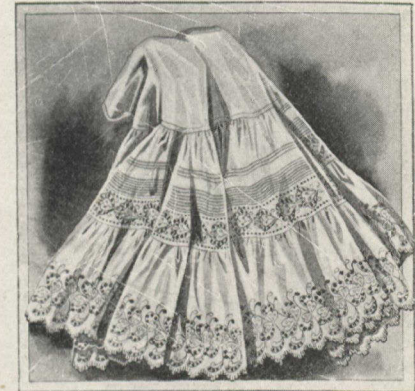
R1-80. Women's Skirt , made of good cotton, deep umbrella flounce of fine lawn trimmed with 10 fine tucks, one row extra wide fine Swiss insertion, finished with wide flounce of extra fine Swiss skirting embroidery, lengths 40, 42 and 44 inches..... 2.50