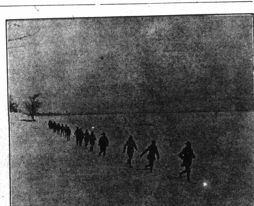
A SNOWSHOE TRAMP OVER THE ST. LAWRENCE RIVER.

sport in Canada is curling, which for charge, had not the British Ambassatrouble in the States is that the to the older man, but of late has been trips to Russia for skating purposes being built, in which the water is Quebec, the Ancient Capital, which Snow Shoeing Peculiar to Canada rest, so that in the majority of the and a half, while one in Montreal is society events; in Canada the spec- weight, but not mechanically perfect, speed and jumping records are owntators use all the furs they own to nor polished. The game was not ed in Canada. The snow shoe, like lakeep warm,—as well as, occasional played in rinks as at present, but on crosse, is a legacy from the Indian, doses of other frost resisters from open ice surfaces, where it was not and was, at first, as it is still in the so exact a science as it has since outlying countries to the north, not become, but was the scene of much a sport, but the only means of winter jolfity, and the consumption of quan- locomotion. It is practically confined titles of the national beverage of the to Quebec, Eastern Ontario and Mani-The most famous hockey team of Scotsmen who were the chief execent years is undoubtedly that ponents of the game at that time, as