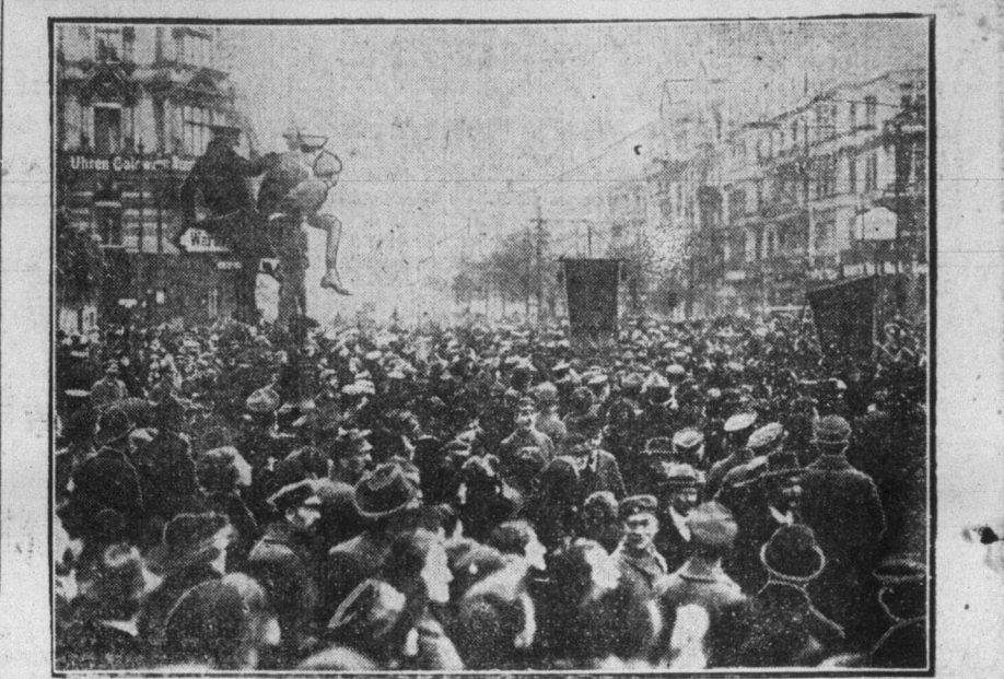
A FOUR-MILE FUNERAL PROCESSION. The funerals of Liebknecht and thirty-two other Spartacists in Berlin, passed off unexpectantly quietly, though the military were prepared for all eventualities. Wreaths were carried in the procession, which was more than four miles long. The picture shows a dense crowd which watched the cortege.

The store that saves you money with quality goods.