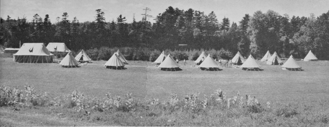
Under canvas at Long Island Training Camp last summer (above) were these husky young recruits at the right.