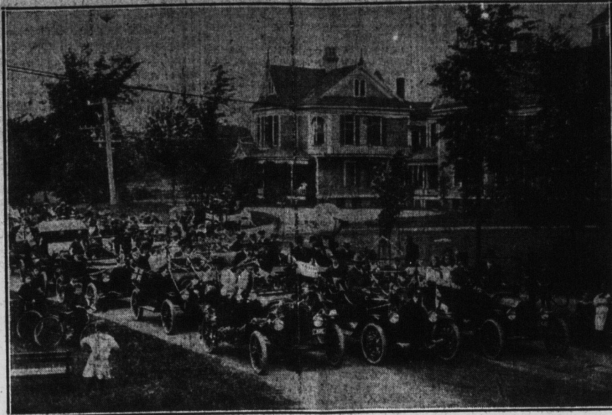
The above picture shows some of the Ford cars after they arrived in Fredericton on Monday last from St. John.