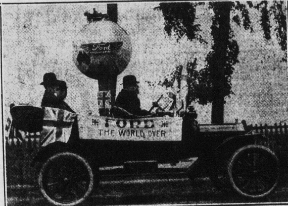
The party in this car seemed imbued with a patriotic spirit as well as some leanings towards a roving existence. The slogan, 'Ford the world over,' showed the extent to which the Ford has become known.