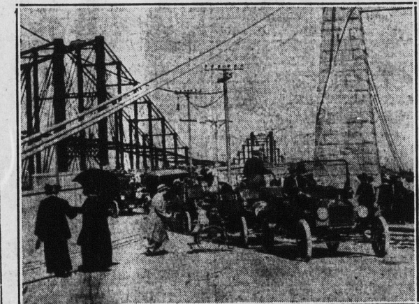
Ford automobiles at the old Suspension Bridge on their way to the capital. Those in the party stopped at this interesting point and surveyed the old bridge, which is being dismantled, and the new highway bridge.

An interesting fact in connection with the manufacture of Willard Storage Batteries is that the oak which they use for boxes is so hard that furniture makers are unwilling to use it for any except special purposes, inasmuch as it is difficult to work and dulls the edges of ordinary tools. The Willard Company searched all over this country before they discovered this material, which they believe is superior to any other for the purpose. In addition to using very hard wood, they groove the corners of their boxes and lock them together with hard maple dowels securing the bottoms with lead-coated, acid-proof screws. They say that as a result of these precautions many months are added to the battery's life in service. Ordinary cheap battery boxes are quickly rotted apart by the bumps which they get over rough roads and car tracks.