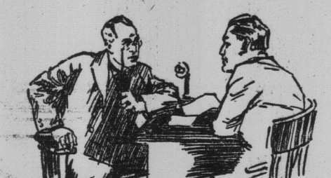
It safeguards your income—

Guaranteed to You Under Our New Special Indemnity Plan