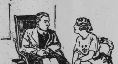
—if you become permanently disabled—