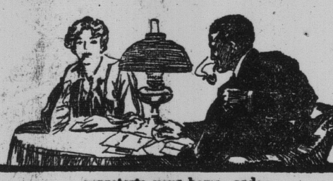
—protects your home, and—