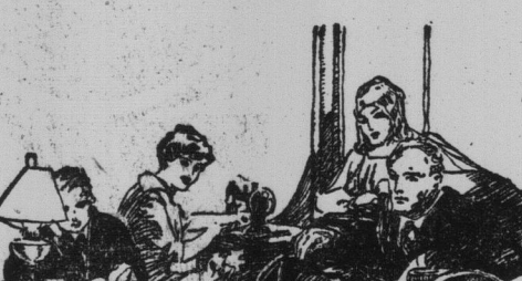
—pays you $50 a month for life, and