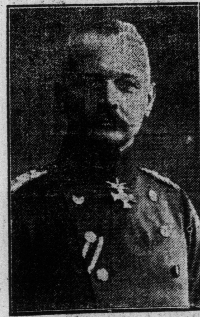
General Von Falkenhayn, now Prussian war minister, who is not a fighting man, but is said to be an excellent man to keep the army machine going without war.