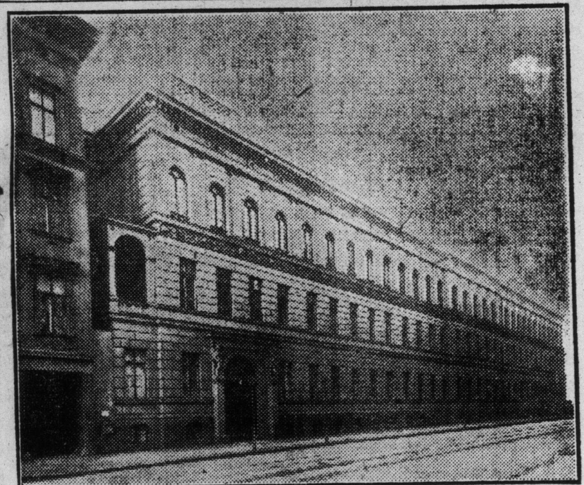
PRUSSIAN WAR MINISTRY, WHICH, AS AN AGENT OF PEACE, HAS BEEN LIKENED TO THE CARNEGIE PALACE OF PEACE AT THE HAGUE.