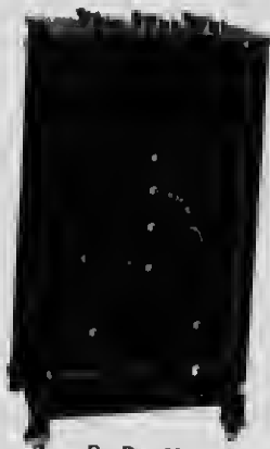
Pat. Dec. 25, 1917 "MEDACO," Model D