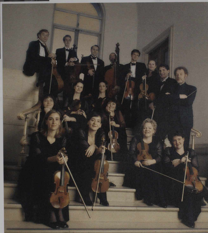
I Musici de Montréal, with conductor Yuli Turovsky

Contemporary music is the specialty of Montreal's Nouvel Ensemble Moderne (NEM), a chamber group that has won critical acclaim in the United States, Europe and