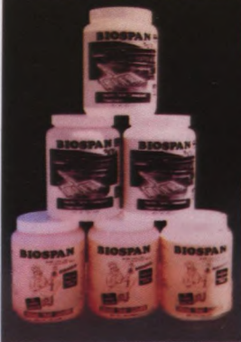
Easy to use, organic BIOSPAN drain line and grease trap cleaners replace chemical cleaners for all septic tank, drainage and organic clogs in residential, commercial and industrial applications.