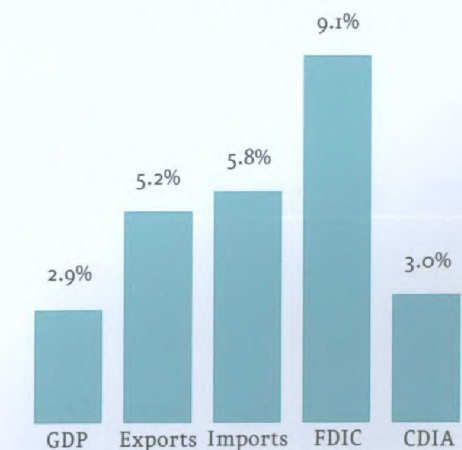
Canada's International Trade and Investment Performance in 2005 (annual growth rate)