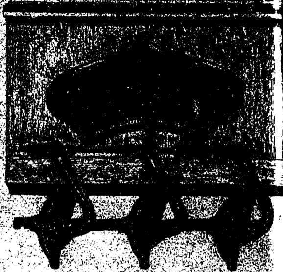
Index Plate, showing how Change of Quantity is made.