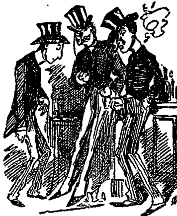
A GOOD NUMBER.

BABOONY (3 a.m.)—"Ver' much 'bliged, old boy, for offer of a bunk; but how'er jek know this is right house? Numbersh keep zig zaggin all 'round."