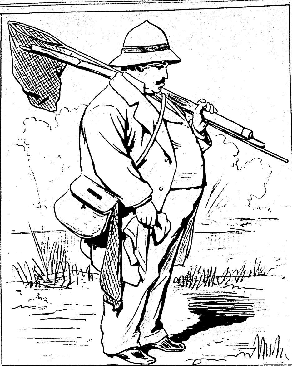
THE WIFE WANTS CARP.—I want bass; and I catch.....a dreadful cold in the head.

Gray's SYRUP OF RED SPRUCE GUM Sold By All Druggists FOR COUGHS & COLDS