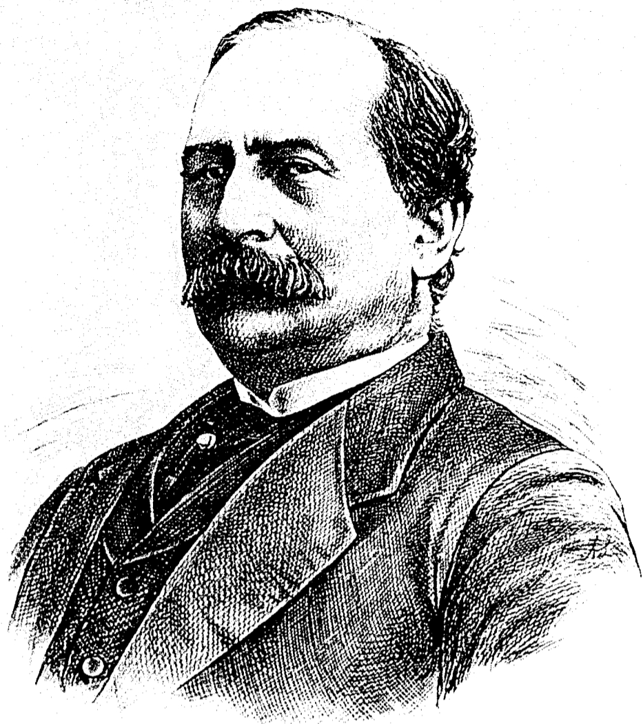
No. 290.—HON. A. G. JONES, MINISTER OF MILITIA.