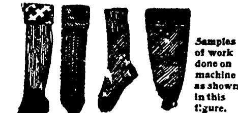
Samples of work done on machine as shown in this figure.