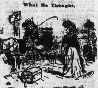
Visitor—Your wife wrote me that she would send her 'drag' to meet me at the station.

Jones—Oh, that's all right. She meant me—Leslie's Weekly.