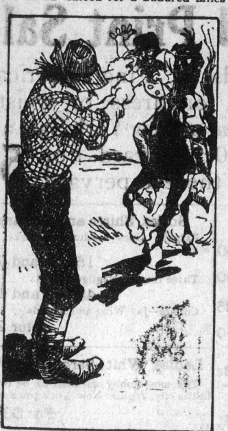
"GIT OFF'N YER CRITTER AND HOLD UP YER HANDS!"

[Copyright, 1906, by R. Douglas.] "I wish to explain to this crowd," said Judge Hoke of Sandy Bend as court was duly opened, "that I'm not feeling well today. I'm feeling homesick; I'm feeling lonesome; I'm feeling as if there was nuthin' more to live for on this terrestrial globe of ours. I won't deny that as I sat in the Red Dog saloon half an hour since (the Red Dog belongs to this yere court and is the leadin' saloon for a hundred miles