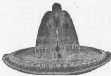
Design No. 1007.

Very Neat and Artistic For Man and Beast.