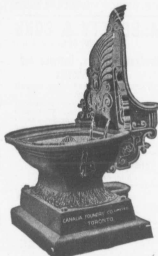
Design No. 1010.

Very Neat and Artistic For Man and Beast.