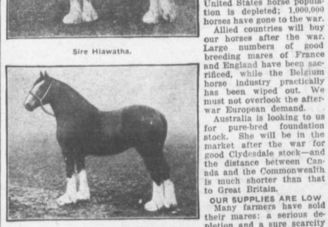
Daughter and Granddaughter Boquhar Lady

These results cannot be obtained by in-discriminate breeding. The best blood con-sistently mated will do it—and nothing else. It has made the Clydesdale Breed what it is. has made every other Famous Breed