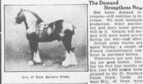
Sire of Dam Baron's Pride.