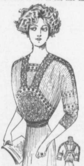
FANCY WAIST, 6909

Caps that protect the hair and sleeves that protect the blouses are absolutely necessary to neatness and cleanliness when one is engaged in work that means possibility of soil. Here are models that are practical and simple and also attractive. They can be made from any simple washable material, but the square cap is especially suited to a handkerchief. The half sleeves are finished with casing and elastic at the upper edges and are easily drawn on and off. For the round cap and sleeves will be required 1 1/2 yards of material 27 inches wide or 1 1/4 yards 36 inches wide, for the square cap will be needed 1 handkerchief 18 inches square with 3 yards of ribbon; and for the half sleeves alone 1/2 yard 27 inches wide or 1/4 yard 36 inches wide will be required. The pattern is cut in one size only.