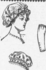
SQUARE AND ROUND SWEEPING CAPS, WITH HALF SLEEVES, 6918

SIX GORED SKIRT, 6902. The plain six gored skirt is a favorite one. It is admirably well adapted to a variety of materials, but is especially adapted for the heavier washable ones, such as linen, pique, poplin and the like. The skirt is cut in six gores and the closing can be made either at the left of the back or at the left of the front. The quantity of material required for the medium size is 5 1/2 yards 27 inches wide, 3 1/2 yards 36 or 2 1/2 yards 44 inches wide. This pattern is cut in sizes 22, 24, 26, 28, 30 and 32 inch waist measure.