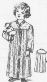
CHILD'S KIMONO, 6915

This fancy waist is cut in one with short sleeves, and is one of the smartest that the season has brought forth. The trimming gives the suggestion of the high giraffe, or bib, that makes such a feature of present styles, yet it is finished at the natural waist line where any preferred. Medium size requires 1 1/2 yards 27 inches wide, 1 yard 36 or 3/4 yard 44 with 1 1/2 yards of all-over lace 18 inches wide, 2 1/2 yards of lace banding and 2 1/2 yards of embroidered banding. 3/4 yard 18 inches wide for yoke and collar. This pattern is cut in sizes 34, 36, 38 and very little labor for the making. This pattern is cut in sizes 34, 36, 38 and 40 inch bust measure.