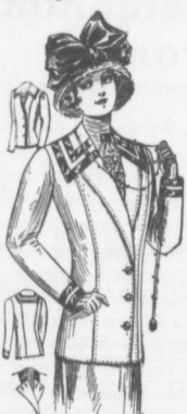
COAT WITH SAILOR OR ROUND COLLAR, 6920 WITH OR WITHOUT REVERS

The kimono that is made with a plain yoke is one of the best liked for the little children. The lower portion is full and ample and allows free movement. China silk, cotton crepe, albatros, washable flannel, lawn, batiste, all the materials that are used for kimonos are appropriate for this one. For the 2 year size will be required 4 yards of material 27 inches wide, 2 1/2 yards 36 or 2 yards 44 inches wide, 2 1/2 yards of ribbon 4 inches wide for bands. The pattern is cut in sizes of 1, 2 and 4 years of age.