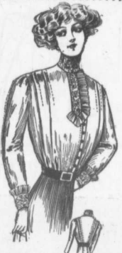
BLOUSE OR SHIRT WAIST, 6934

The coat that is made with a fancy collar is a favorite one of the season. This model is exceptionally chic and smart, while it also allows of three methods of treatment. It can be made with the ends of the collar arranged over the revers or with the collar arranged over the revers and the three ways are equally smart. Medium size requires 5 yards of material 27 inches wide, 3 1/2 yards 44 or 32 inches wide with 3 1/2 yards of banding. The pattern is cut in sizes 34, 36, 38, 40, 42 and 44 in.