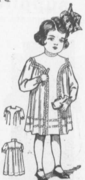
CHILD'S DRESS, 6924

Shirt waists that are closed slightly to the left of the front are among the latest to have appeared. This one can be trimmed as illustrated or made plain as preferred. The quantity of material required for the medium size is 3 1/2 yards 27 inches wide, 2 1/2 yards 36 or 1 1/2 yards 44 inches wide, with 1 1/2 yard of all-over embroidery and 1 yard of plaiting to trim as illustrated. This pattern is cut in sizes 34, 36, 38, 40 and 42.