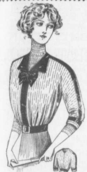
OVER BLOUSE WITH BODY AND SLEEVES IN ONE, 6903

Realizing the great interest that our readers take in the new spring styles, we shall give additional space to the pattern department of Farm and Dairy for this week. Look over the illustrations in the fashion department and send your orders early. If you do not see the style illustrated that you would like, advise us, and we will do our best to get it for you. Write all prices plainly, giving name and address, size and number of pattern desired. Address, Pattern Dept., Farm and Dairy, Peterboro, Ont.