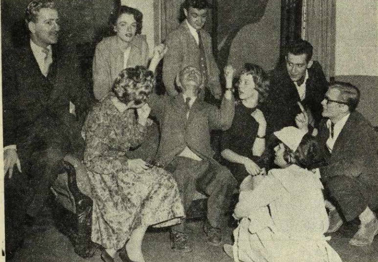
PEP TALK FOR PLAYERS OF "G. and M."

Interviews will be held at your University on the 7th of December,