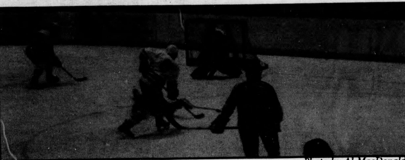
Red Devils blasting Huskies

The Huskies, staging a comeback, scored twice in the second period to cut UNB's lead