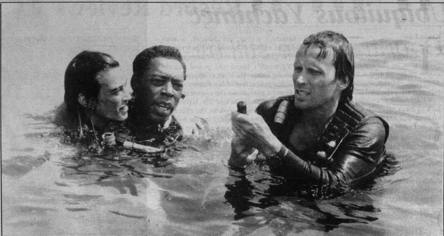
Amanda Pays, Ernie Hudson and Peter Weller fight to stay above water in Leviathan , a horribly derivative flick that has few redeeming qualities.

enter a derelict Russian ship and come out with an old safe. The name on the broken bow of the ship is "Leviathan." Returning to Shack 7, which is home to eight people nearing the end of their months-long shift, the rusted safe is opened, revealing some old files, a videotaped captain's log and an old bottle of vodka. It turns out that the vodka is contaminated with a strange germ that, once loose, mutates its victim into a strange thing that