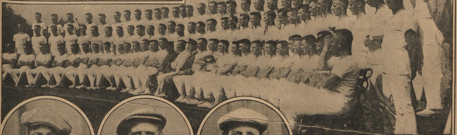
PHYSICAL instructors forming the Model Camp at the Canadian National.