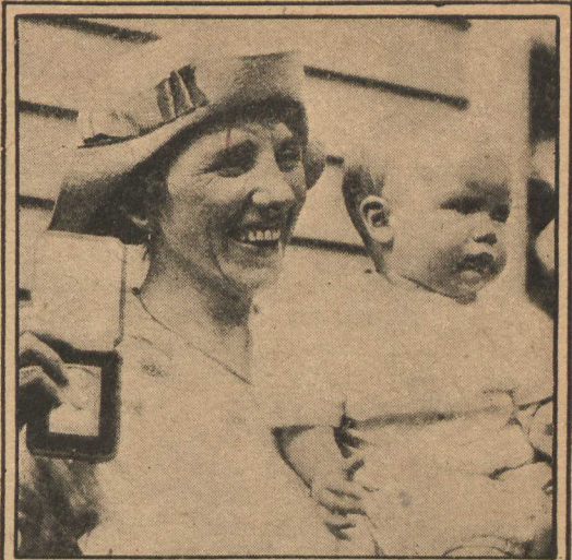
CANADIAN National Exhibition's prize baby, seven months old.