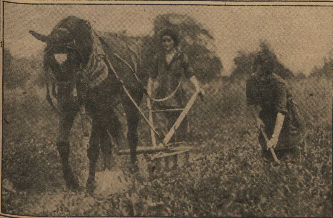
ONCE more university girls (Toronto) out in the school of nature down on the fruits farms of Grimsby, Ont. One "scuffles," the other hoes. All's right with the world.